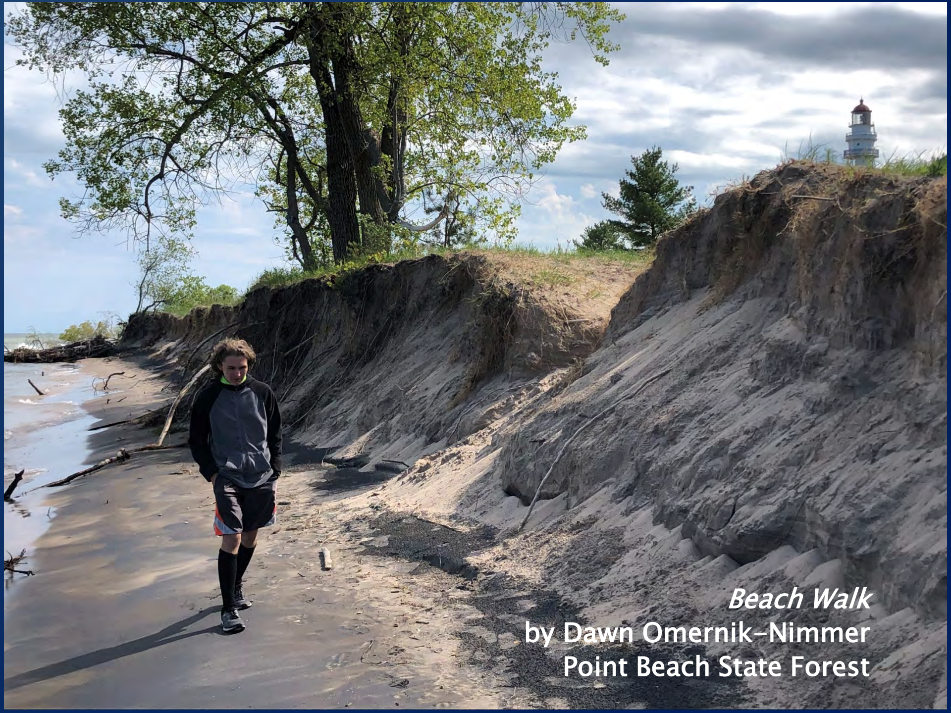
Beach Walk by Dawn Omernik–Nimmer Point Beach State Forest