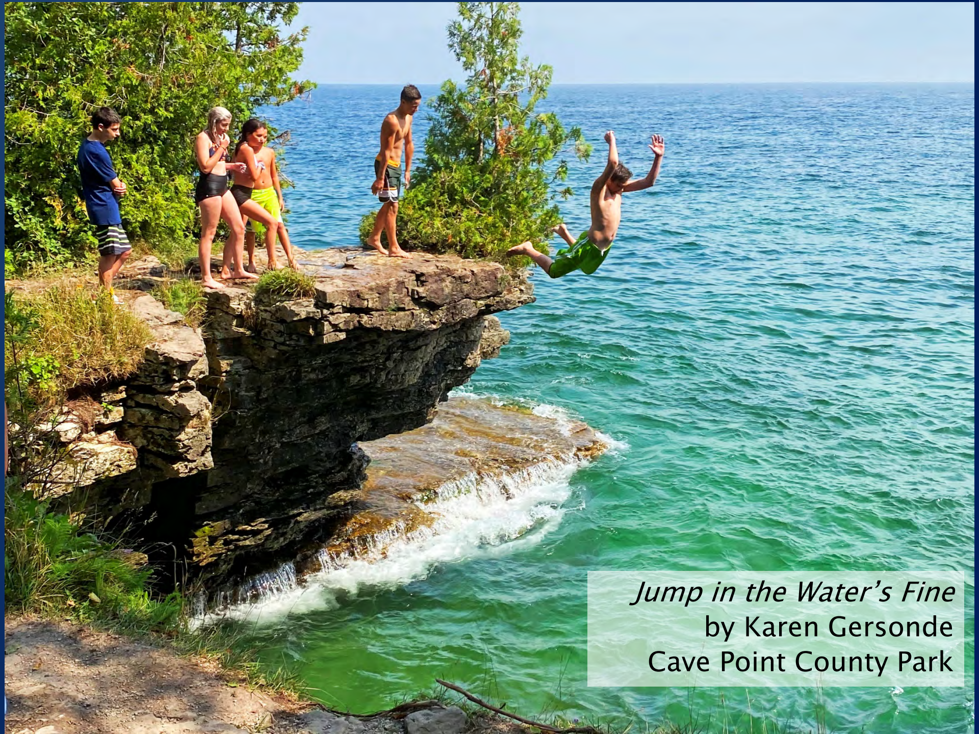
Jump in the Water's Fine by Karen Gersonde Cave Point County Park