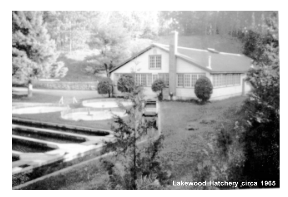
Fish propagation has always been an important tool in managing Wisconsin's fisheries and, when combined with todays' habitat protection and enhancement activities, offers the best opportunity for sustained fisheries in the state.