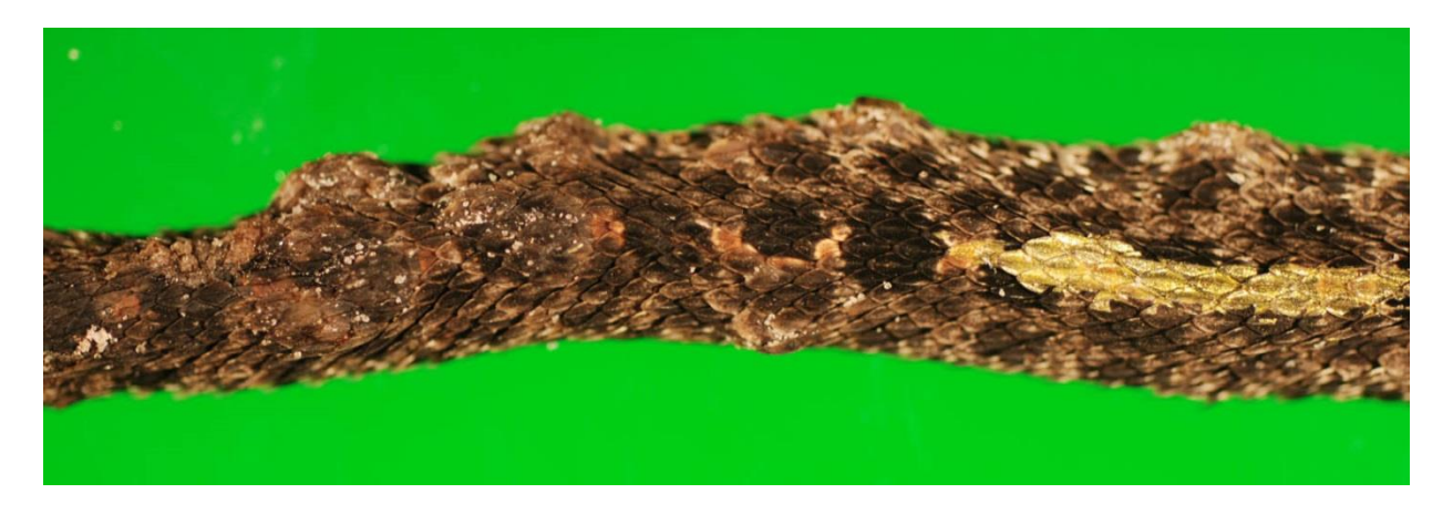
Tail of an infected pygmy rattlesnake. Note the numerous lumps (nodules) below the skin which are caused by the fungus.