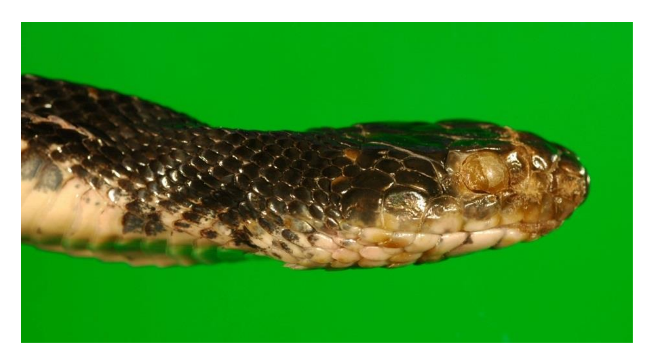
Ratsnake demonstrating scabbing and thickening of the skin on the snout, chin, jaw, and eye.