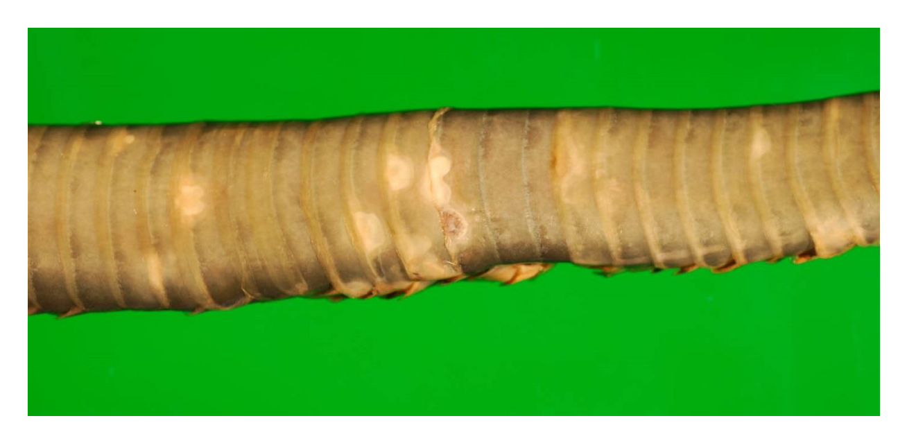
Belly scales of an infected racer. The white spots indicate thickening skin. A single brown spot (scab) is also visible.