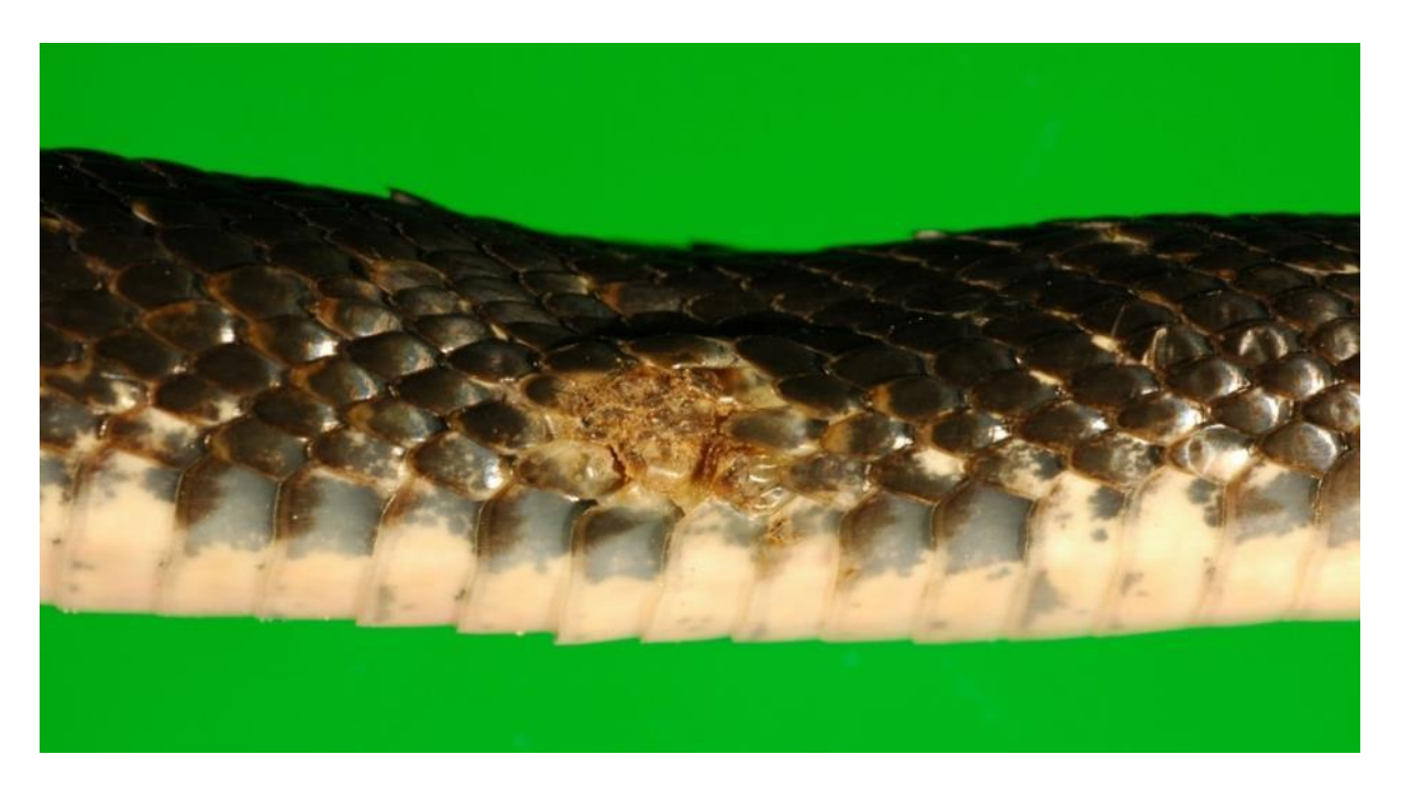
Patch of thickened, crusty scales on the side of the body of the same ratsnake.