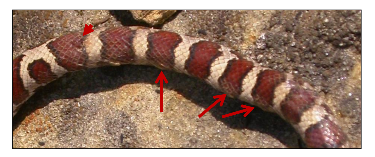
Milk snake found dead in the field with numerous nodules (arrows) and thickened scales (arrowhead) on the body. Also note the mixture of shiny and dull scales.