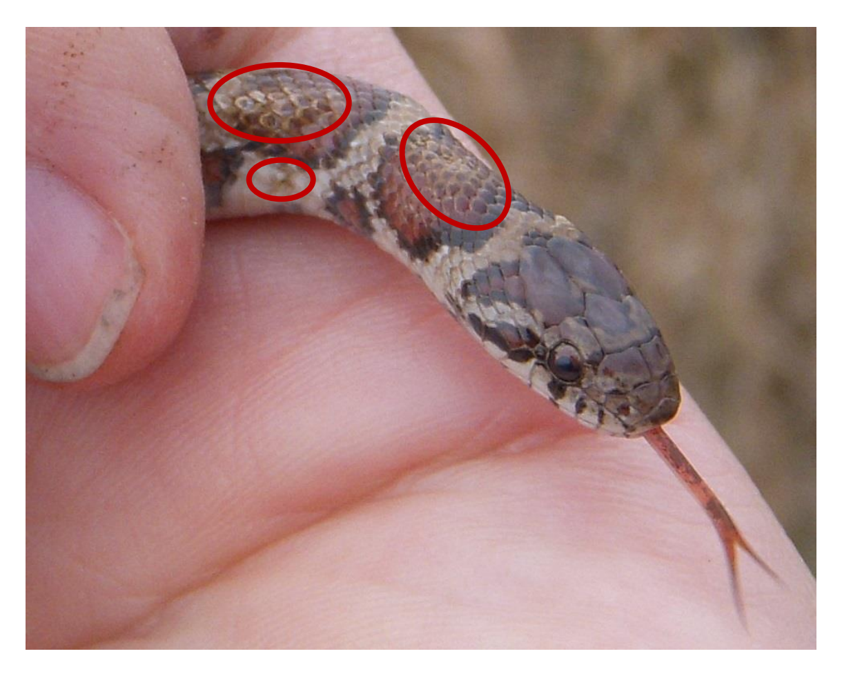
Milksnake with several areas of thickened skin.