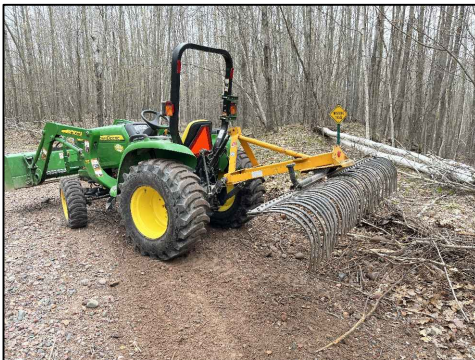
Raking ATV Trail