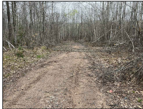
ATV Trail – Before Raking