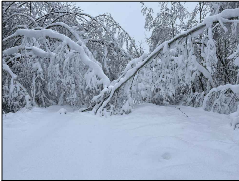
ATV Trail Dec 2022 Snowstorm