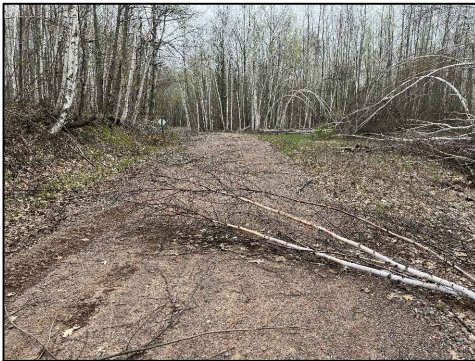
ATV Trail – Before Raking