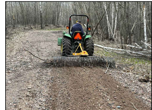
Raking ATV Trail