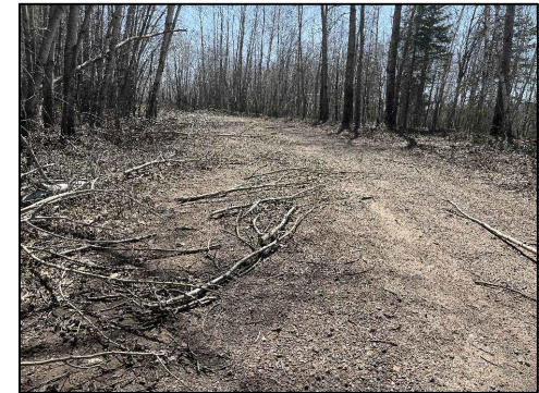
ATV Trail – Before Raking