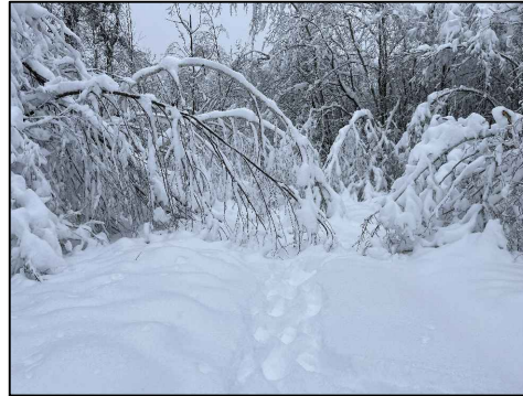
ATV Trail Dec 2022 Snowstorm