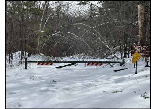
ATV Trail Dec 2022 Snowstorm