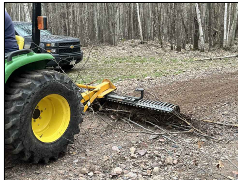
Raking ATV Trail