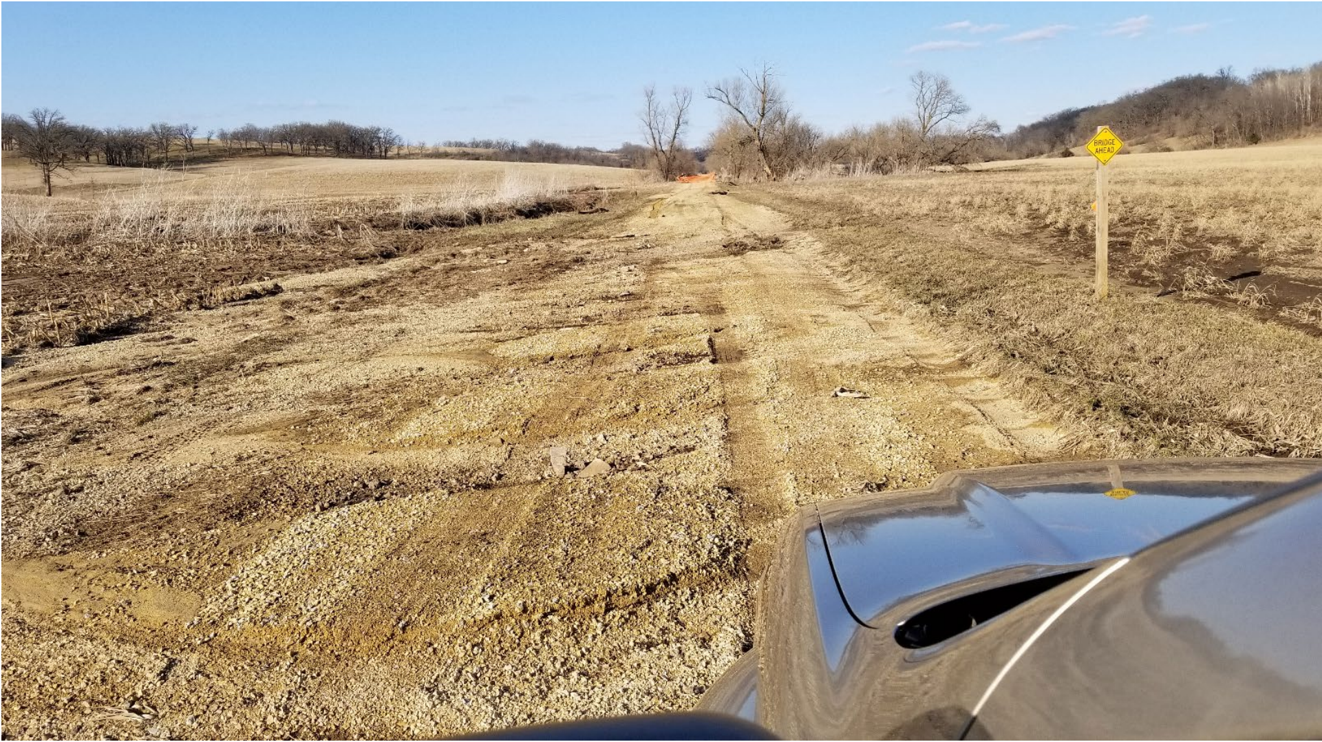
Trail condition after spring flooding. Just to the east of Browntown in Green Co