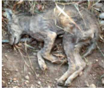
Dead Coyote found outside of a Wisconsin Home

For information about disease risks for humans, please contact the Department of Health and Family services at http://www.dhfs.state.wi.us , your County Health Department, or visit the Center for Disease Control website www.cdc.gov .