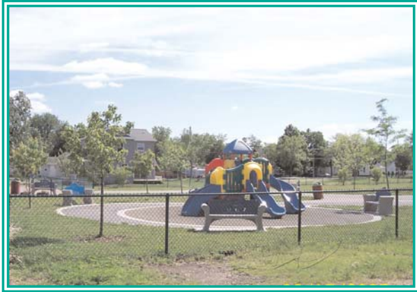
The new neighborhood park after cleanup (photo by DNR).

Two homes have been completed on the property, while two more are under construction and expected to be completed in 2005-06. Once all proposed housing units are completed, the assessed total value of the housing units is $750,000.