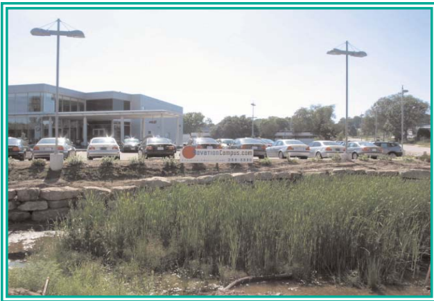
The new Zimbrick BMW dealership, located within the Novation Campus (photo by Megan Clemens, DNR).

The Icke Landfill property with adjacent redevelopment is now valued at approximately $30 million. The Town of Madison will gain approximately 75 additional jobs with the first phase of the Novation Campus development.