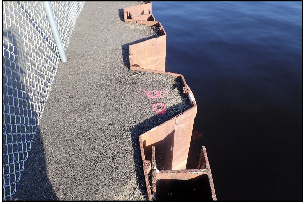
PHOTO 3. View of barrier wall at Dimple Point D-30 with offshore H-piles, looking northwest.