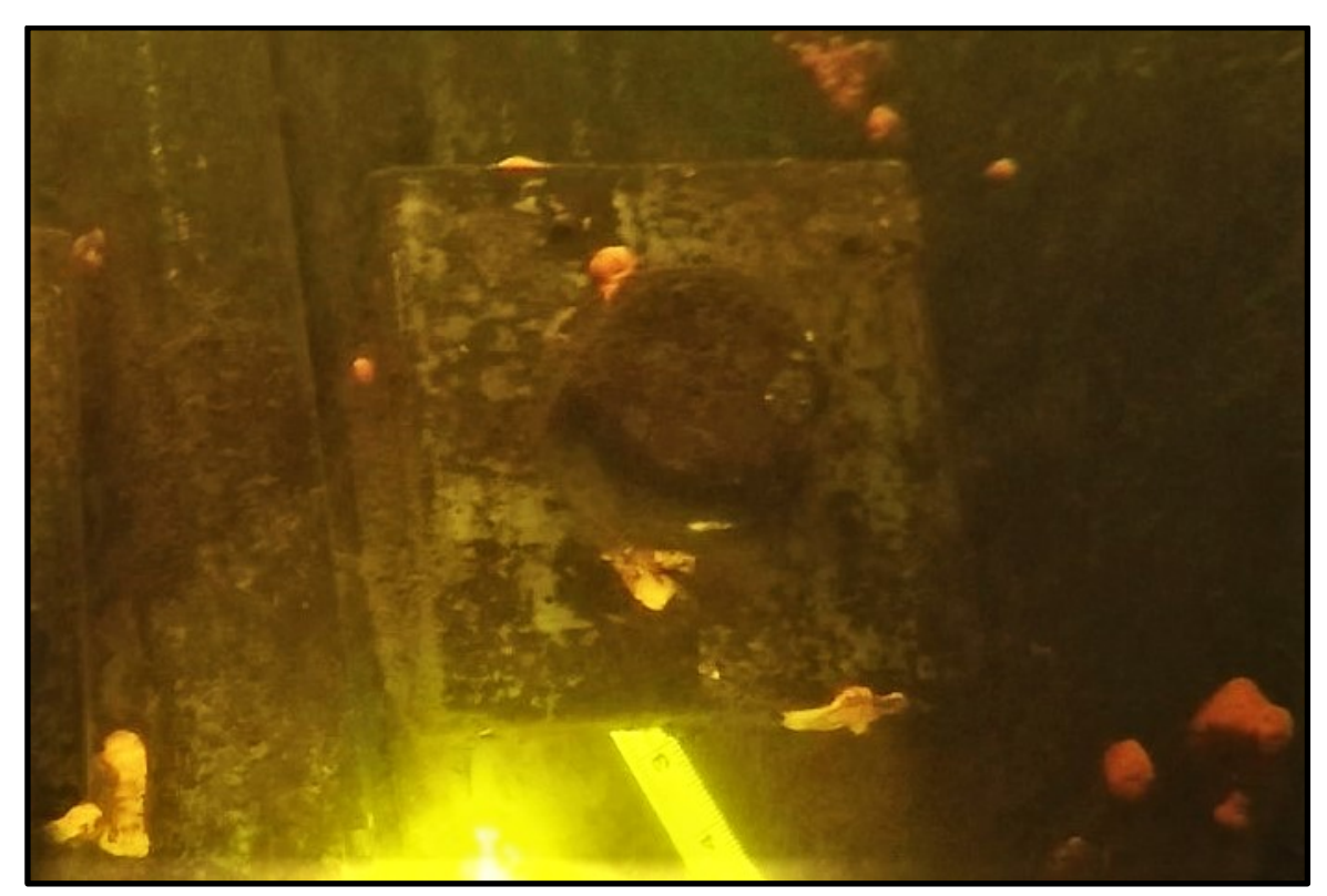
PHOTO 6. Underwater view of a ruler penetrating 2.75 inches into the gap between the washer plate and steel sheet pile.