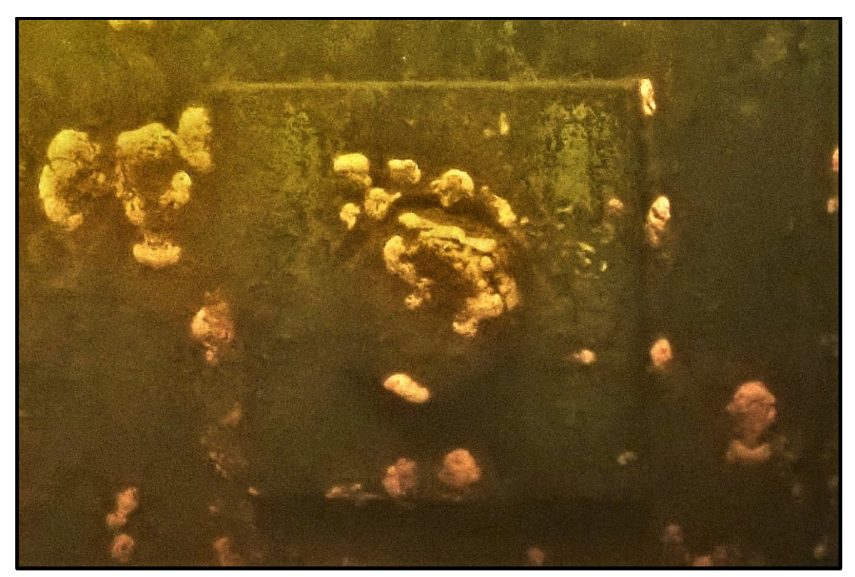
PHOTO 2. Underwater view of typical waler connection bolts and washer plate.