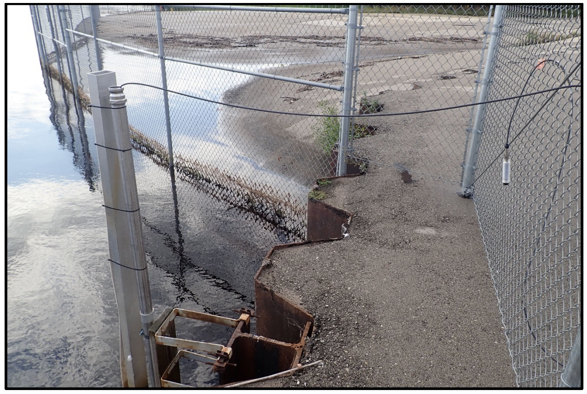
PHOTO 9. Above water view of the transition between generations of VBW at PT "F", looking south. The chain link fence follows the submerged 2010 barrier wall.