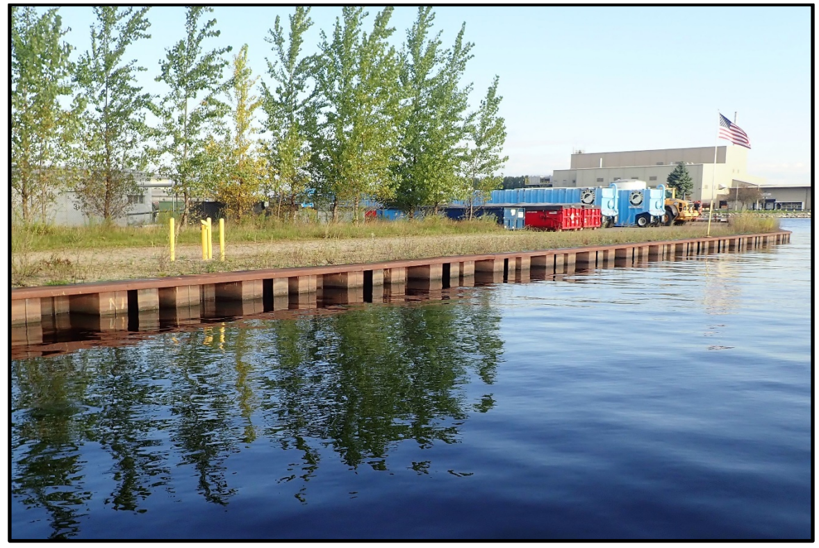
PHOTO 1. Overall view of the typical 2010 containment barrier wall, looking northwest.