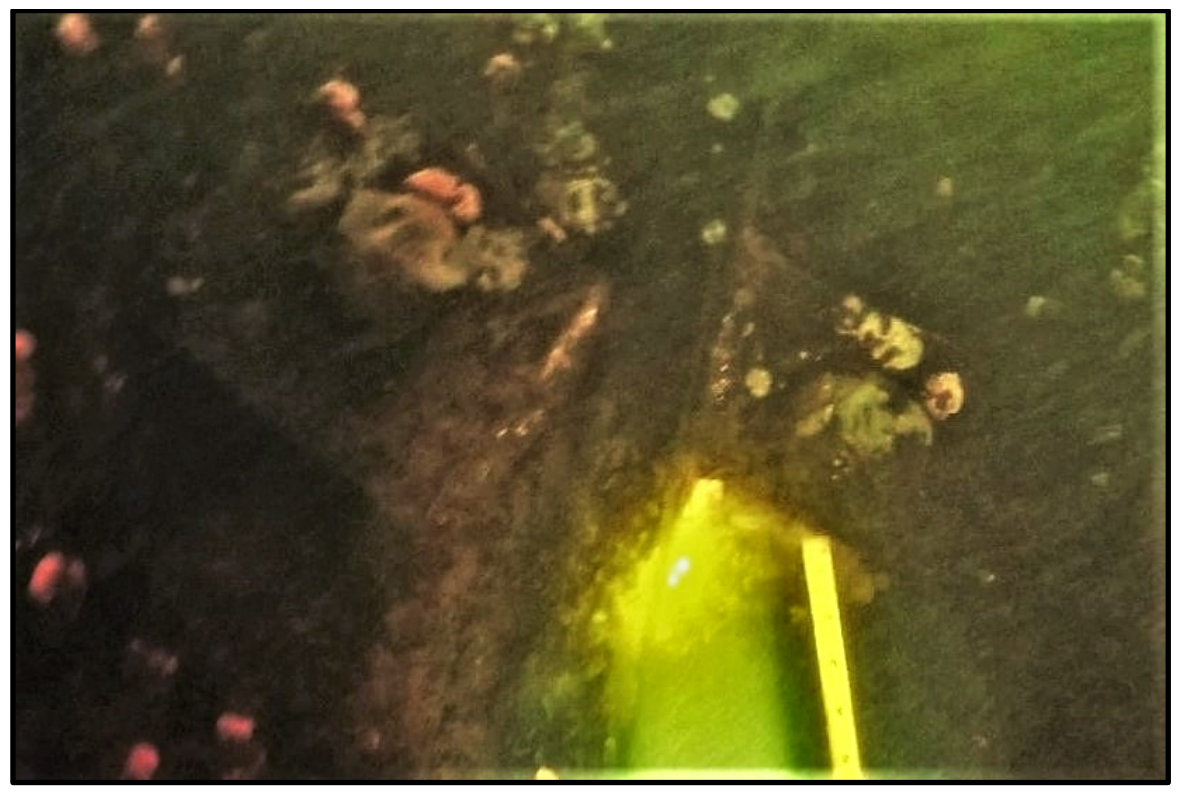
PHOTO 7. Underwater view of the broken washer plate at approximately 35 ft past D-12, looking south.