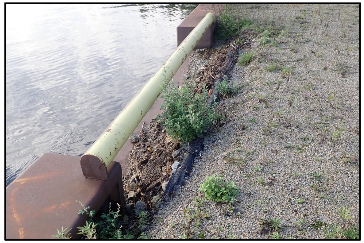
PHOTO 5. View of a typical weir cut in the barrier wall at approximately 10 ft past D-23, looking south.