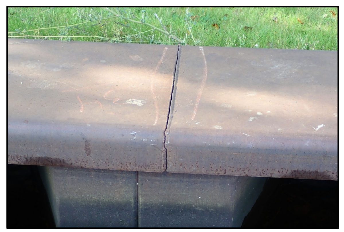
PHOTO 10. View of the cracked weld in the steel bent plate cap at approximately 12 ft past D-6, looking south.