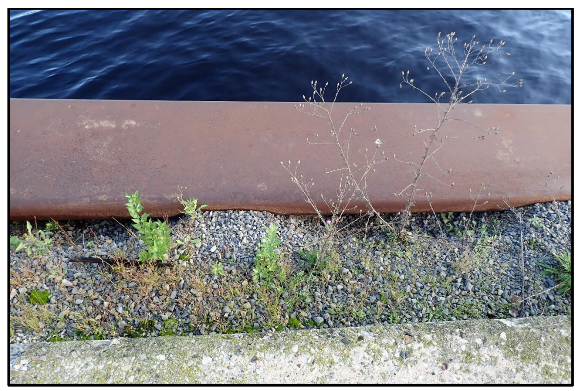
PHOTO 12. View of typical localized erosion on the land side of the barrier wall, looking north.