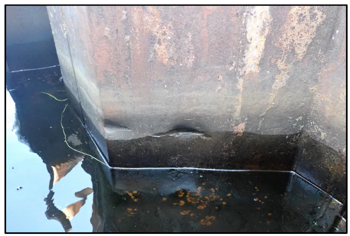
PHOTO 8. View of minor impact damage on the steel sheet pile at approximately 42 ft past D-30, looking southeast.