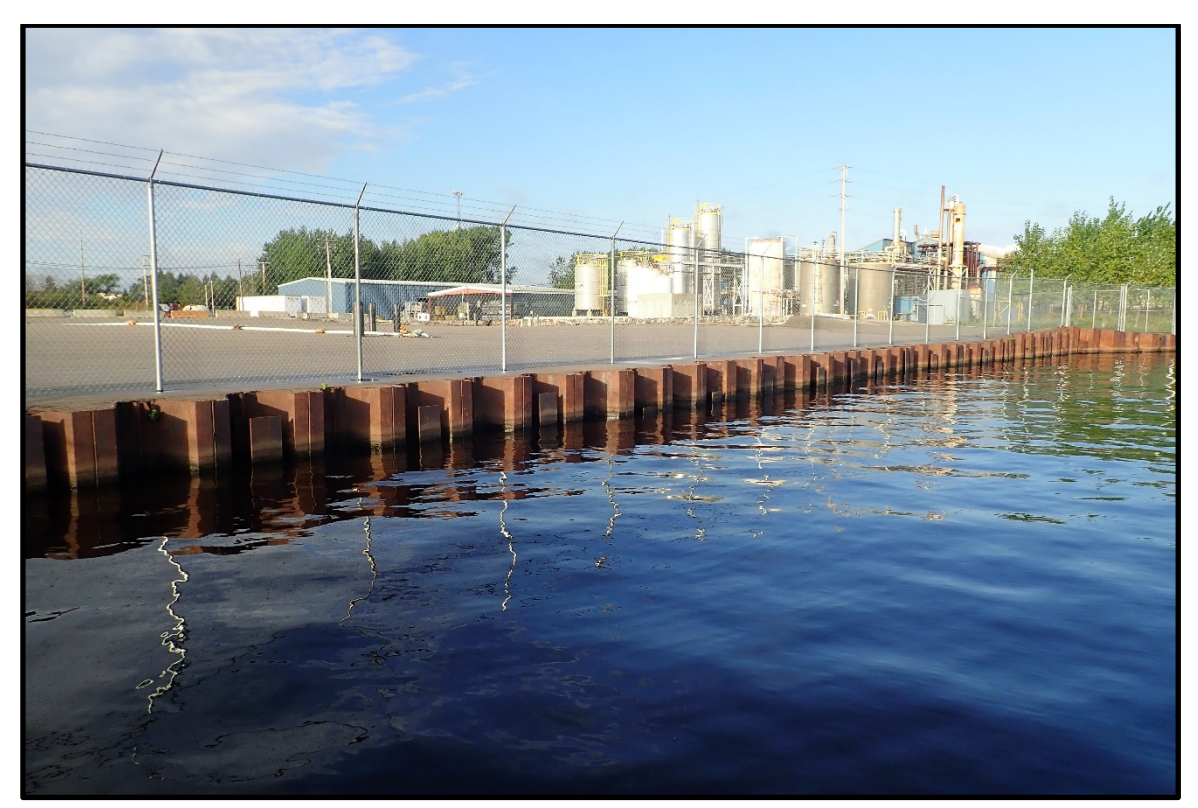
PHOTO 4. Overall view of the typical 1999/2000 containment barrier wall, looking southwest.