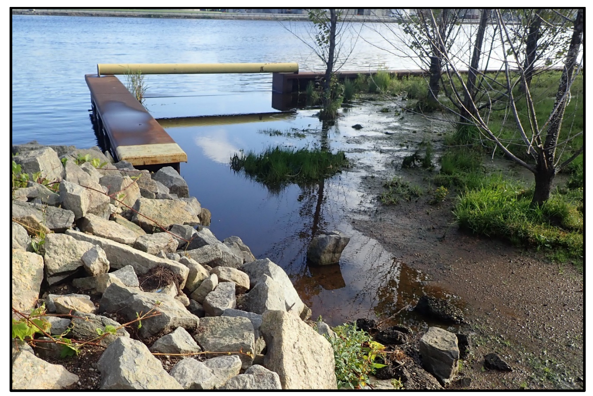
PHOTO 13. View of localized erosion at the weir at the western extent of the structure, looking north.