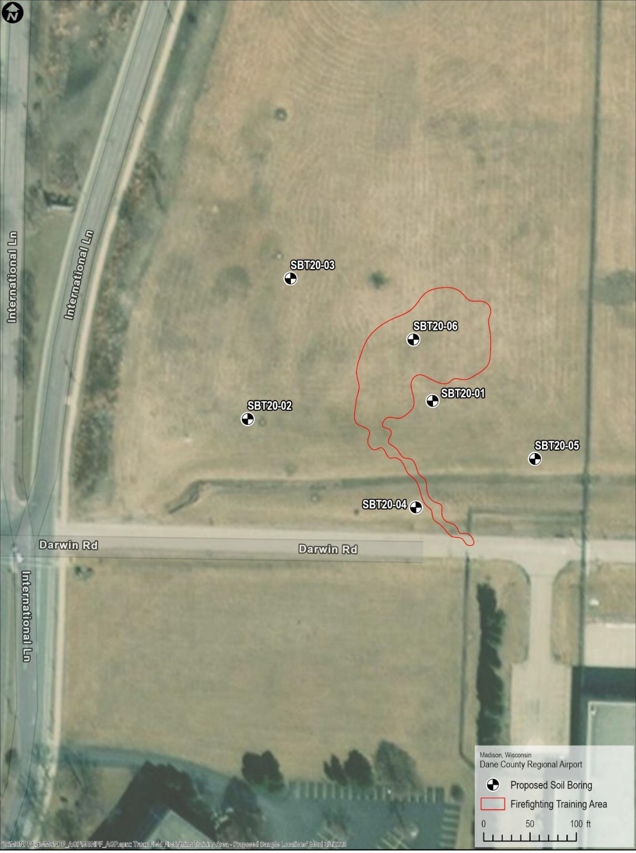
Figure 4. Darwin Street/West Firefighting Training Area Sample Locations.