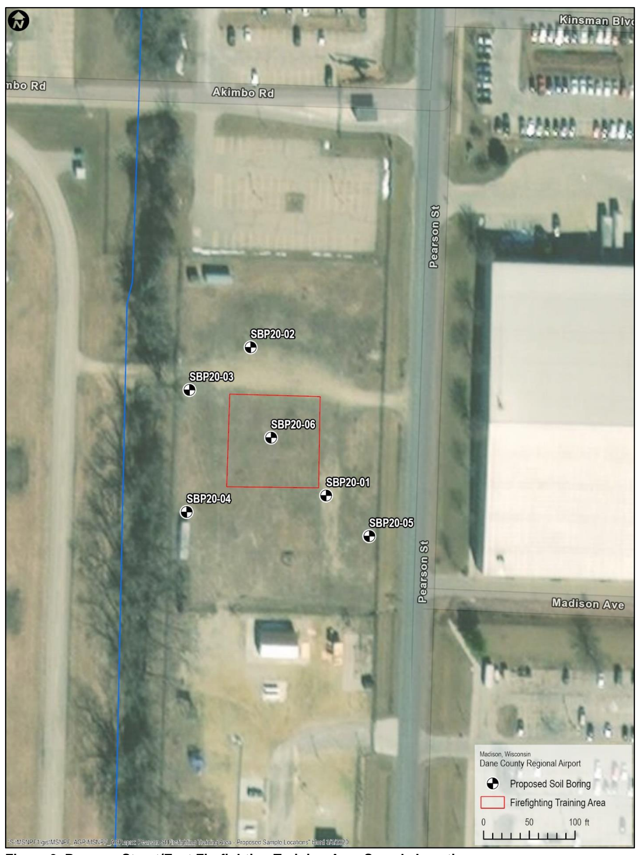
Figure 3. Pearson Street/East Firefighting Training Area Sample Locations.