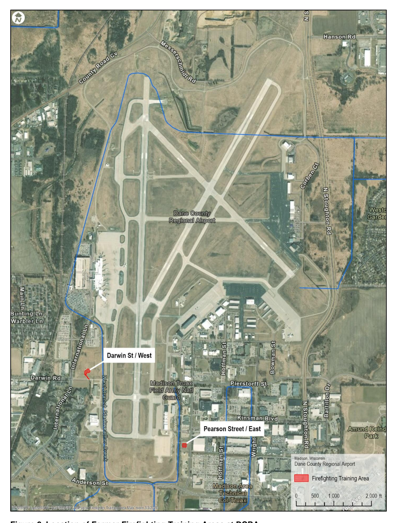
Figure 2. Location of Former Firefighting Training Areas at DCRA.