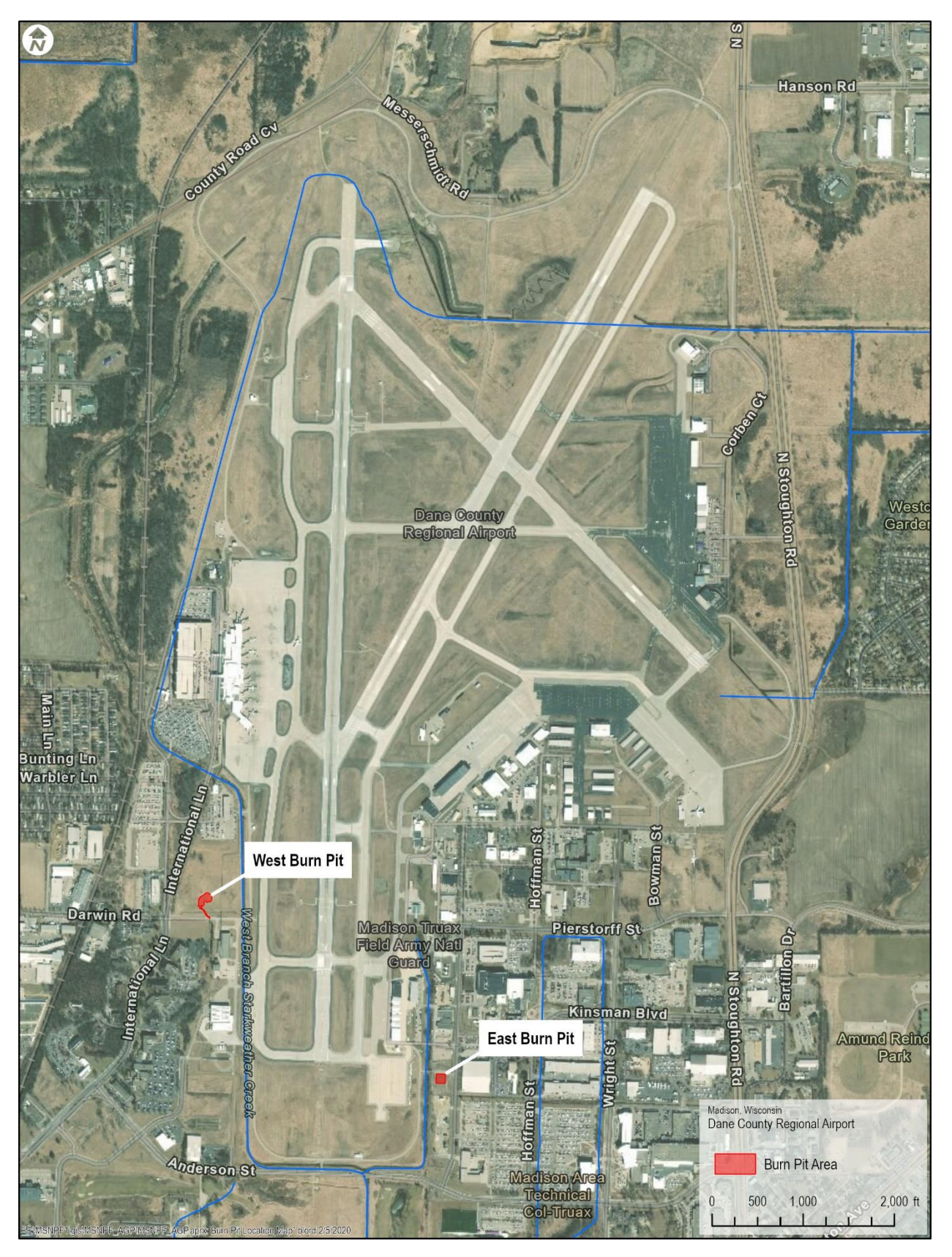
Figure 2. Location of Former Burn Pits at DCRA.