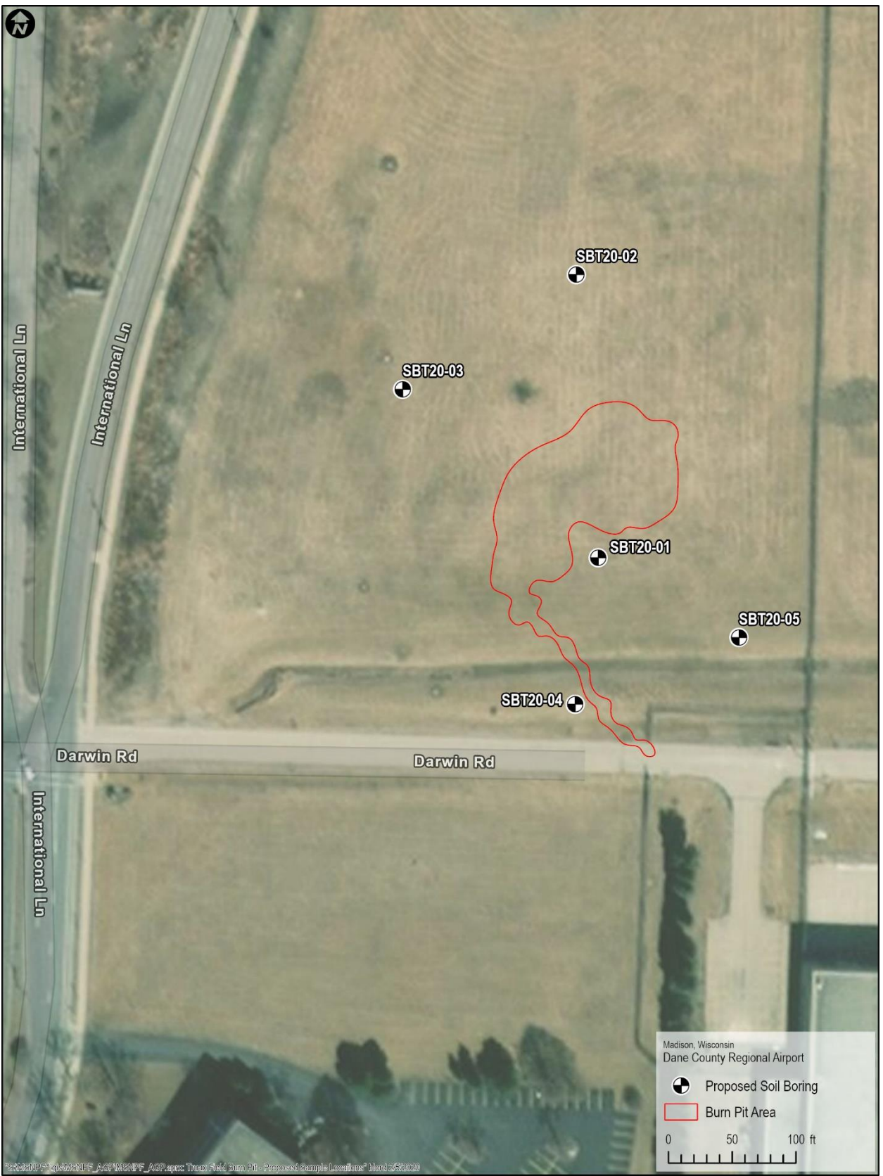
Figure 4. Darwin Street/West Burn Pit Sample Locations.