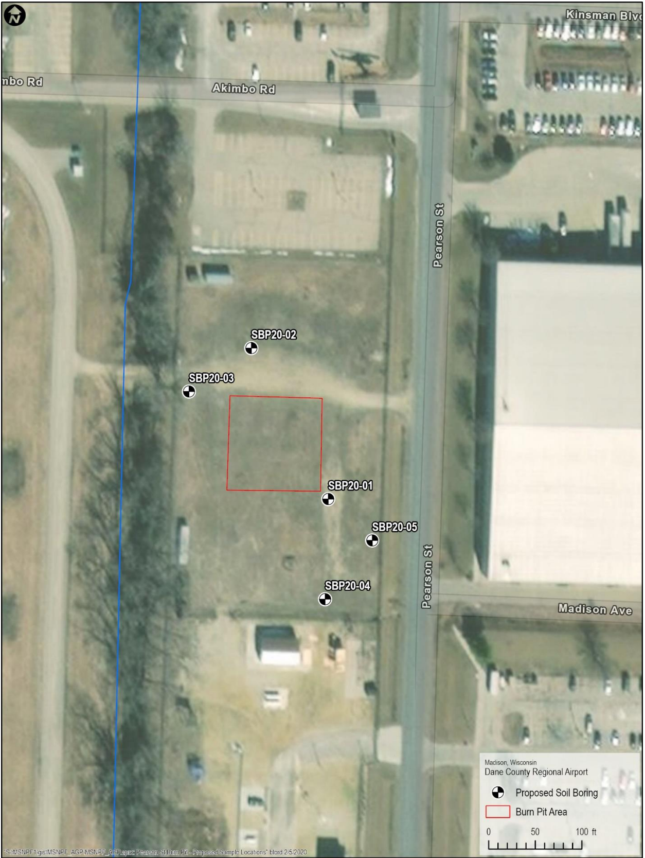
Figure 3. Pearson Street/East Burn Pit Sample Locations.