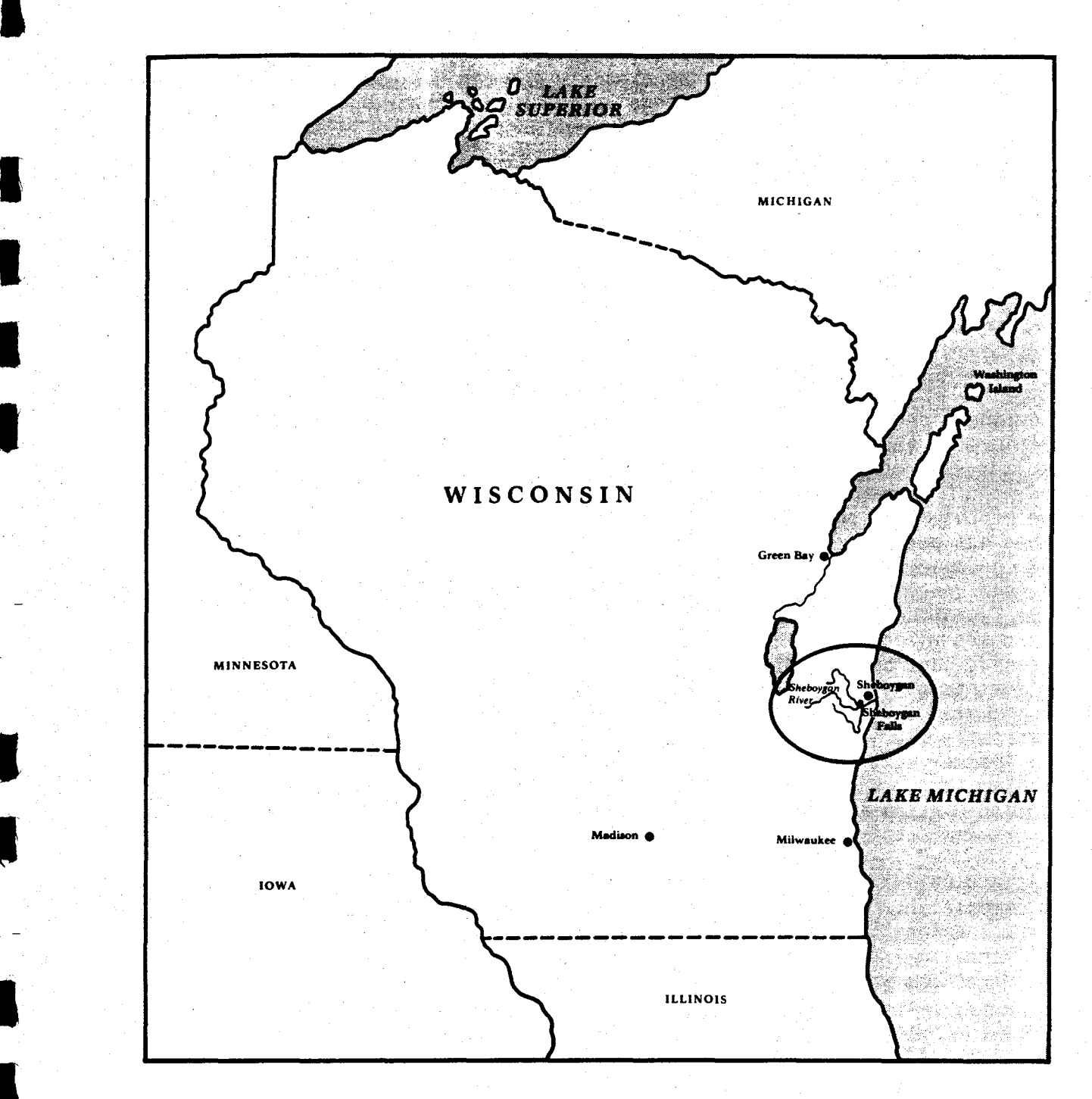
FIGURE 1 Site of Study: Sheyboygan, Wisconsin

and consistent low-level exposures via the public food supply (Jelinek and Corneliussen 1976; Kolbye 1972).