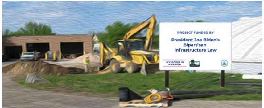
Illustrated example of a photo documenting the use of BIL signage.