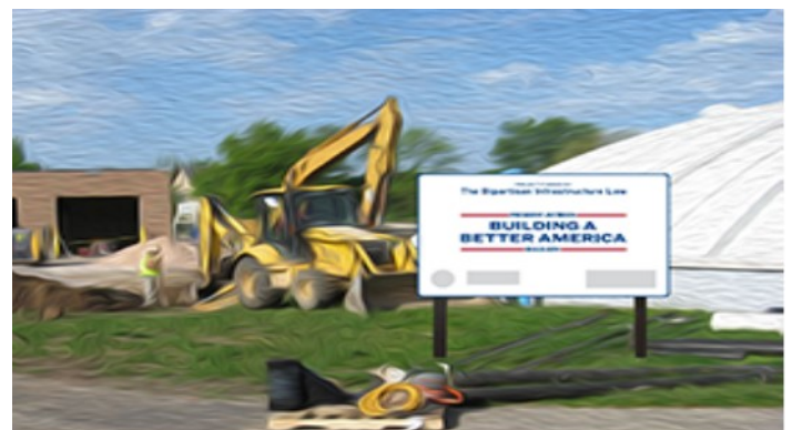
This is an illustrated example of a photo documenting the use of BIL signage.