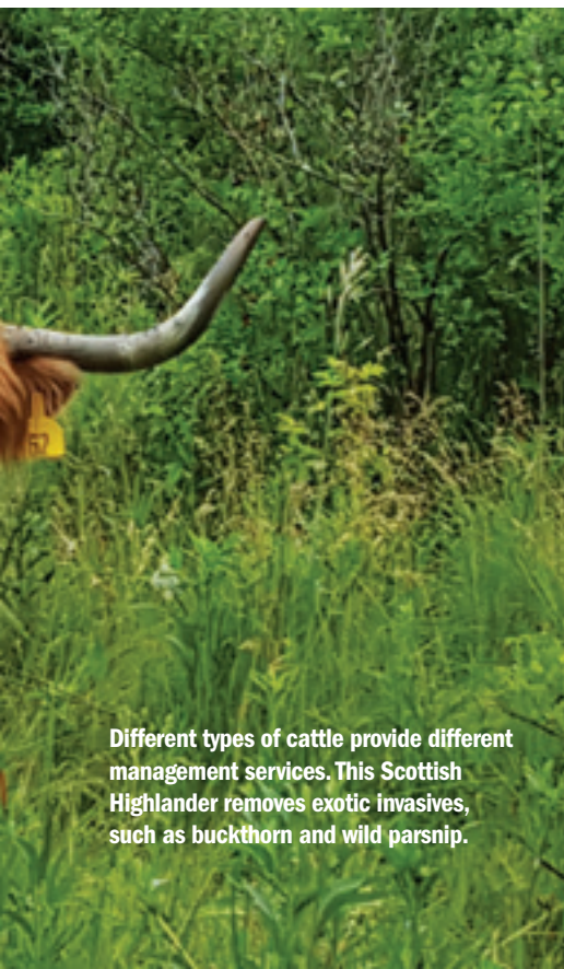
Different types of cattle provide different management services. This Scottish Highlander removes exotic invasives, such as buckthorn and wild parsnip.

Grossman and Kolodziej are working to improve wildlife habitat with cow-calf pairs at varying grazing intensities. They plan to bolster plant species diversity and increase variation in vegetation heights and densities while reducing woody and invasive plant species, and