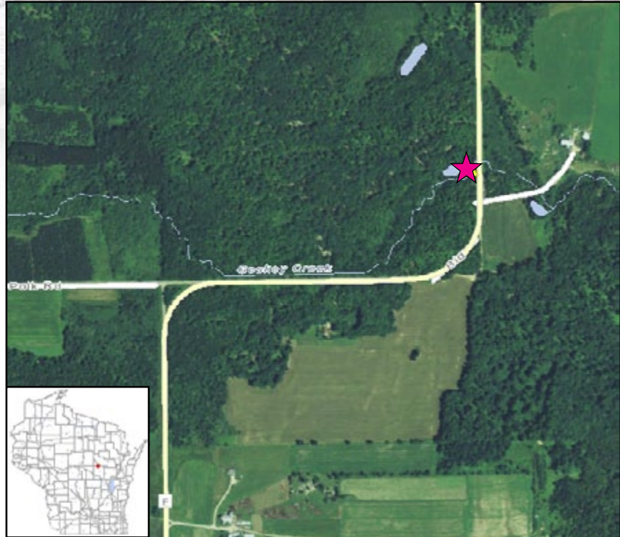
Map Legend ★ - Sampling Location for 2015