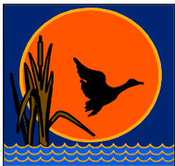
Wisconsin Wetland Inventory