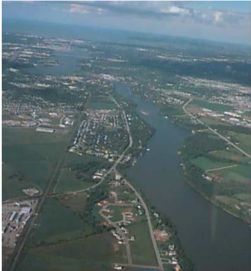
Aerial Photo taken over De Pere, 1997. Agricultural and urban land use surrounds the Lower Fox River.

The Lower Fox River Basin is comprised of six watersheds (East River, Apple/Ashwaubenon, Plum Creek, Fox River/Appleton, Duck Creek and Little Lake Butte des Morts), encompassing the Fox River, Duck Creek, East River, Apple Creek, Plum Creek, Mud Creek, Dutchman Creek and Ashwaubenon Creek, and covering most of Brown, eastern Outagamie, northern Calumet and small sections of Winnebago counties. Figure 1 shows the communities located within the boundaries of the basin, as well as watershed boundaries. Figure 2 shows just the boundaries of the watersheds. Maps of individual watersheds are included as Figures 3 through 9 . The 638 square mile (1,654 square kilometers) drainage basin is bordered by the Twin Door Kewaunee Basin to the north and east, the Manitowoc River Basin to the south and east, the Upper Fox River Basin to the south, the Wolf River Basin to the west and the Upper Green Bay Basin to the north.