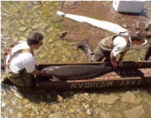
WDNR / USFWS measuring Sturgeon - De Pere Dam