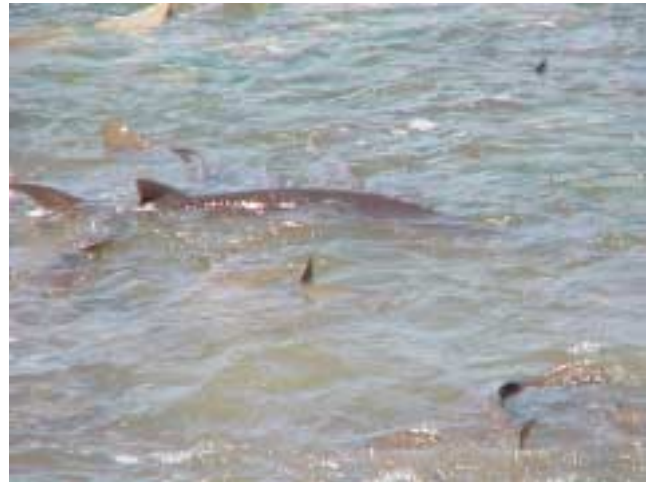
Lake Sturgeon at the De Pere Dam - Fox River