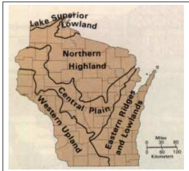
Figure 10. Geographical Provinces of Wisconsin (Hole, 1980)

Soils are comprised of various organic and inorganic materials of different sizes, ranging from boulders to very fine-sized particles of clay. Soil types are classified according to the percent of gravel, sand, silt, clay and organic material, in combination with other physical properties. Other physical properties may include structure, thickness, permeability, chemistry, and slope. The soil types present in an area are among the most significant factors determining groundwater contamination potential, aquifer recharge rates, and surface water flow patterns. The soil types are also important in determining the ability of the soil to attenuate contaminants.