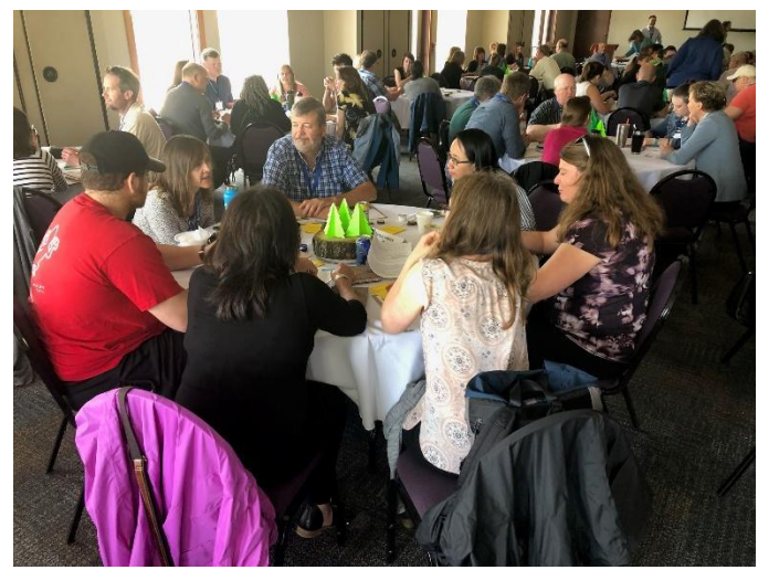
Conference attendees connect during the interactive session.

Conference attendees represented a variety of professional fields.