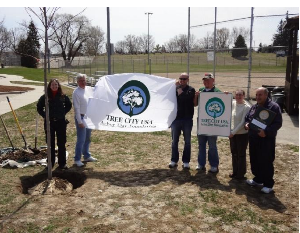
Many communities celebrate Arbor Day and their Tree City USA awards with tree plantings.

Wisconsin Champion Tree Program: The WDNR maintains official records of the largest trees in the state, through a searchable database. The goal of this program is to encourage the appreciation of Wisconsin's forests and trees. The Champion Tree Program is currently on hold as the WDNR Forestry Division is reviewing how to best manage the program going forward. The Council supports the Division of Forestry's decision to continue to maintain the program. The Council feels that the WDNR should look for a viable partner such as WAA to help support and publicize the program. With WAA members knowledgeable about the program there will be the ability for more local arborists from across the state to become active recorders of information. With more active participation, more homeowners and wood lot owners will be able to take pride in their trees, as we search for the next champion tree.