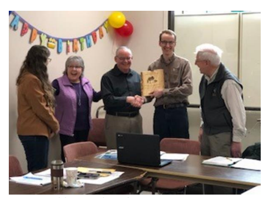
2019: Golden Sands RC&D receives Innovations in Urban Forestry. Award