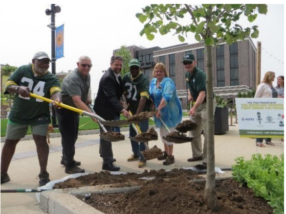
First Downs for Trees media celebration, 7-2019; Titletown Green Bay, WI.

Urban Forestry Grant Program: Over the years this program has been hugely successful in supporting cities, villages, towns, counties, tribes and 501(c)3 nonprofit organizations in the development of new and innovative projects that develop sustainable urban and community forestry programs. A list of the past two years of grant recipients is provided in Appendix C. In 2019 $500,000 were allocated to the grant program. This program is instrumental in advancing improvements of urban forestry programs and is a catalyst for economic development. There is high demand for the program and numerous applicants are denied each year due to lack of funding availability. Twenty percent of the grant money is withheld for possible storm grants, and then released for regular matching grants if not used. In 2019, all the storm grant money was allocated, creating a situation where numerous high-quality grant applicants for matching grants had to be rejected. With the ongoing emerald ash borer crisis, and more frequent