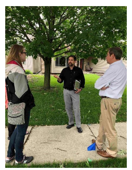
Council tour of Fond du Lac, WI stormwater management project, 6-2019.

Once the USGS has analyzed the results of the studies, we hope that cities that retain or plant more trees to increase urban tree canopy—and those that use a leaf management program like Fond du Lac's—can both use these BMP's (best management practices) in meeting permit requirements, and as a result will be motivated to promote the urban forest.