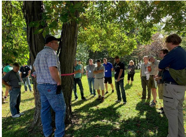
CTMI graduate workshop, 9-2019; Green Lake Conference Center.

First Down for Trees: This program has been proven to be a great success with the Green Bay Packers. Thousands of trees have been planted since 2011, providing millions of dollars of total lifetime benefits through storm water runoff reduction, CO<sub>2</sub> reduction, energy saving, air quality improvement and property value increase. Promotion of this program increases public awareness of the importance of trees. In recent years the Milwaukee Brewers have discontinued their tree planting programs (Root Root Root for the Brewers). Using the Green Bay Packer model, the Council hopes that the WDNR can work with the Brewers to reactivate their tree planting programs with strong and robust partnerships.