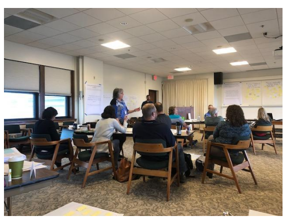
Council meeting for Forest Action Planning, 9-2019; Forest Products Lab.