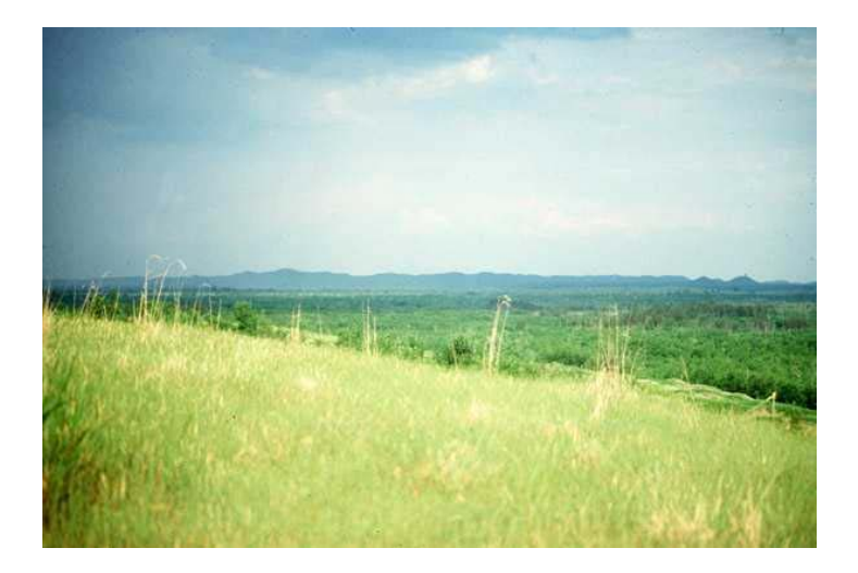
Located in Jackson County, the Inland Steel mine site was successfully reclaimed to a county park, a post-mining land use that offers many recreational opportunities.

For more information please refer to the Wisconsin Department of Natural Resources' Bureau of Waste Management Nonmetallic Mining webpage. This site can be reached by opening the following address <u>http://www.dnr.state.wi.us/org/aw/wm/mining/nonmet.htm</u>. This site can also be accessed by opening the Department's webpage <u>http://www.dnr.state.wi.us</u> and selecting "Environmental Protection", "Waste", "Mining" and finally, "Nonmetallic Mining in Wisconsin".