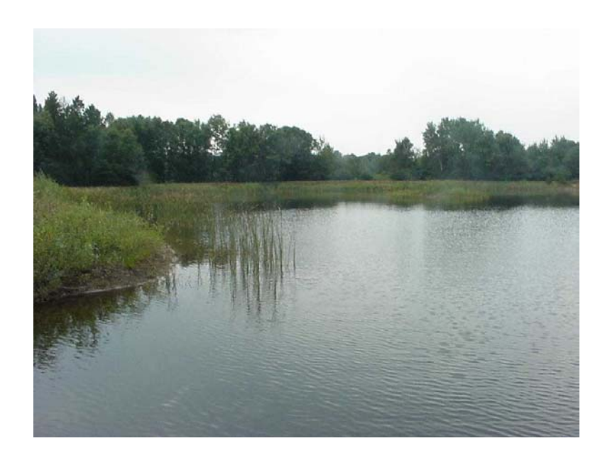
Reclaimed mine site located in Green Lake County. Badger Mining Corporation reclaimed the unconsolidated, bank-sand pit into a shallow lake with wetland habitat. The naturally contoured shoreline blends in well with the surrounding environment.

NR 135.19(7) APPROVAL. The regulatory authority shall approve, approve conditionally or deny the reclamation plan in writing in accordance with s. NR 135.21(1)(f) for existing mines and s. NR 135.21(2) for new or reopened mines. Conditional approvals shall be issued according to s. NR 135.21(3), and denials of permit applications shall be made according to s. NR 135.22.