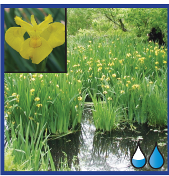
*Yellow iris (Iris pseudacorus)