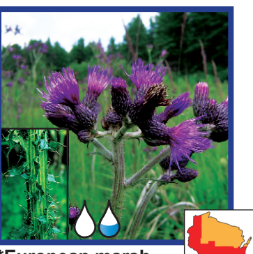
*European marsh thistle (Cirsium palustre)