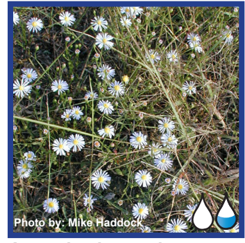
Annual salt marsh aster (Symphyotrichum subulatum)