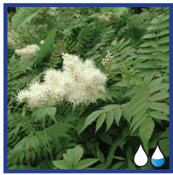
False spirea (Sorbaria sorbifolia)