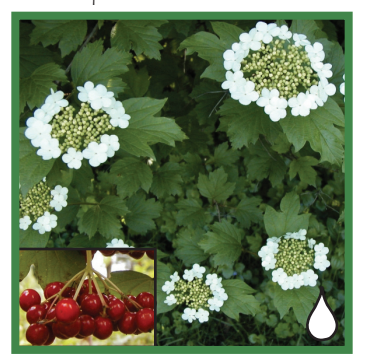
European high-bush cranberry (Viburnum opulus L. subsp. opulus

Early detection plants are either not yet present in WI or not widespread but have the potential to become