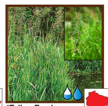
*Tall or Reed manna grass (Glyceria maxima)