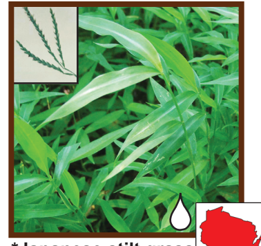
*Japanese stilt grass (Microstegium vimineum)