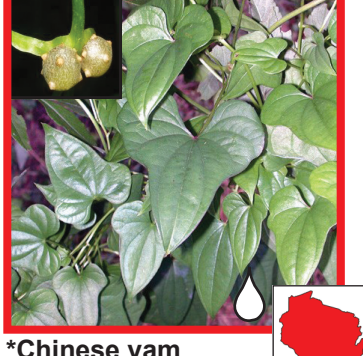
*Chinese yam (Dioscorea oppositifolia)