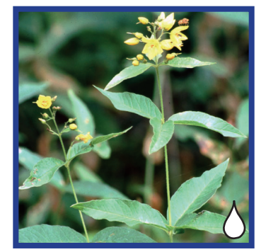
Yellow garden loosestrife (Lysimachia vulgaris)