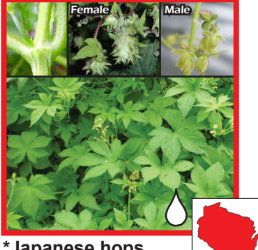
*Japanese hops (Humulus japonicus)