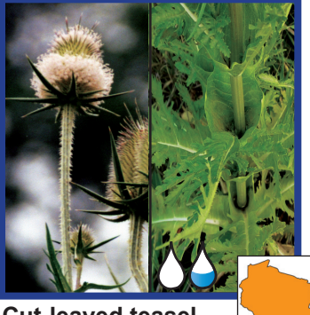
Cut-leaved tease (Dipsacus laciniatus)