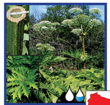
Giant hogweed (Heracleum mantegazzianum)