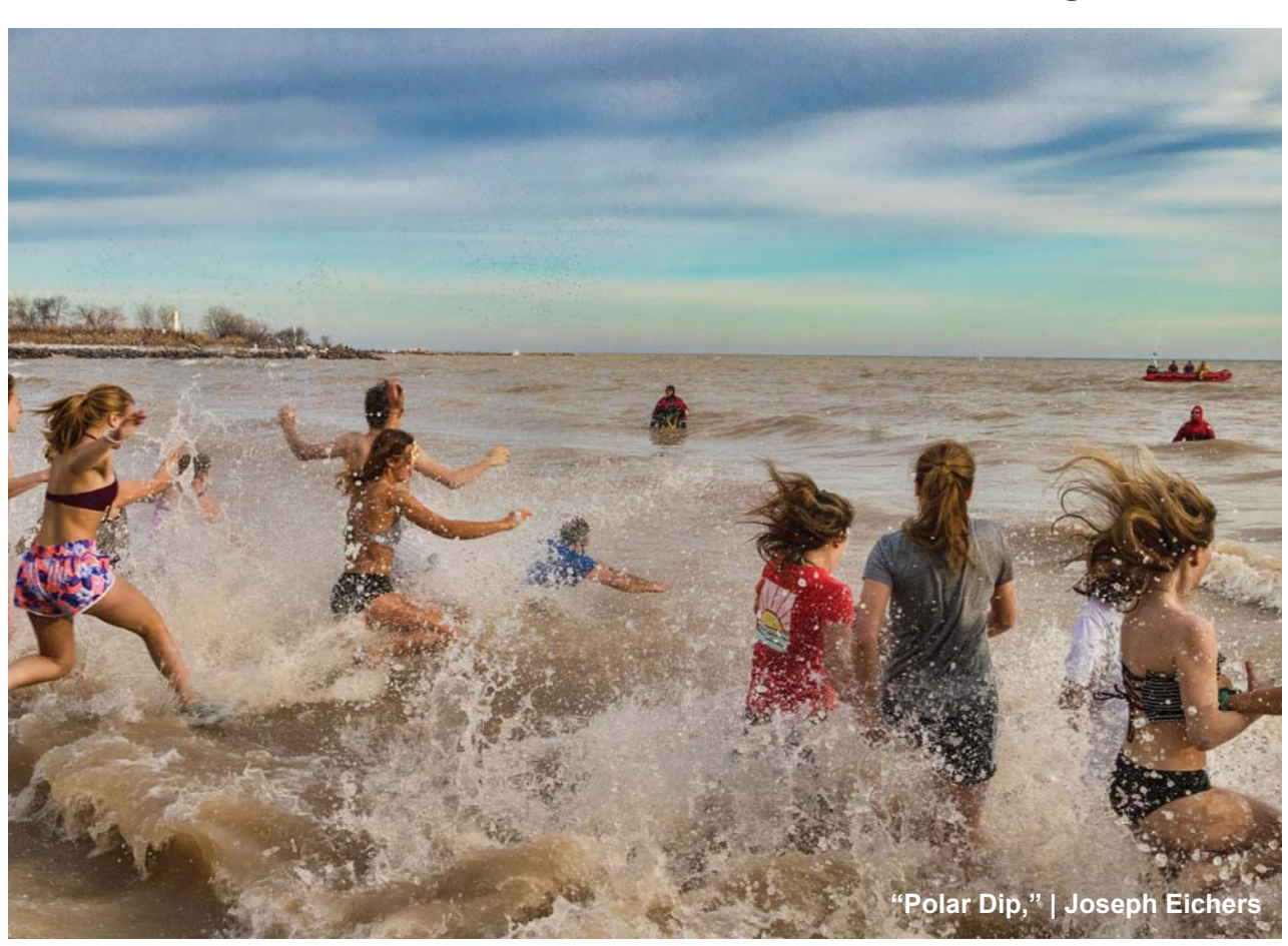
Office of Great Waters Wisconsin Department of Natural Resources December 16, 2021