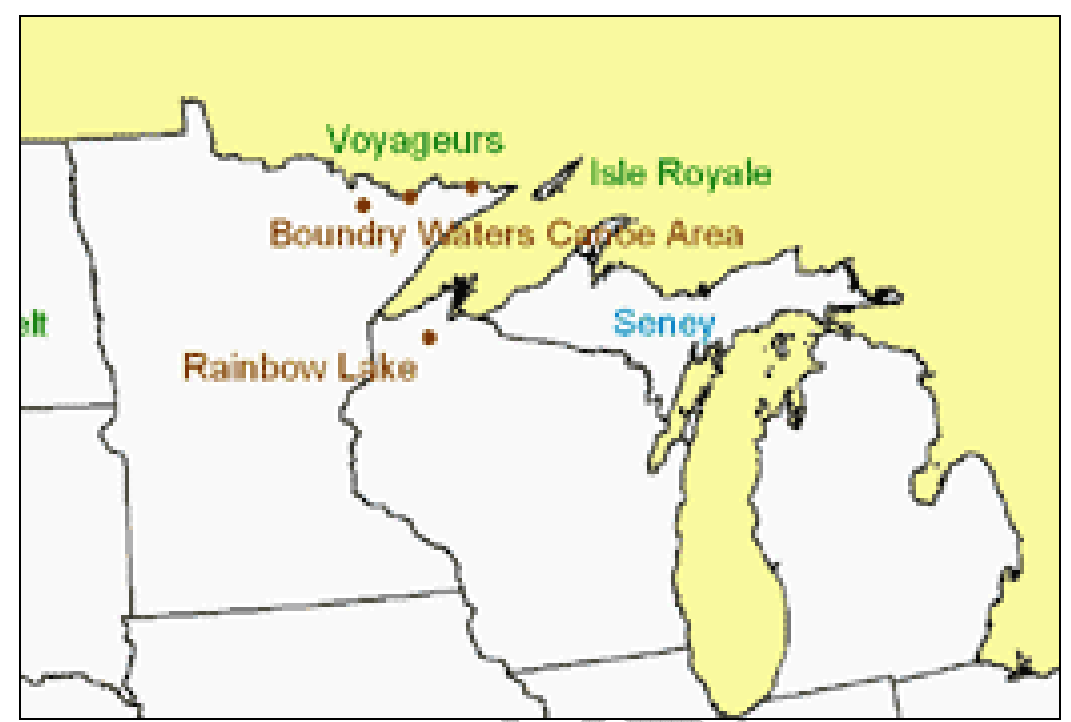
Note: Rainbow Lake is not a listed Class I area under the Regional Haze Rule.