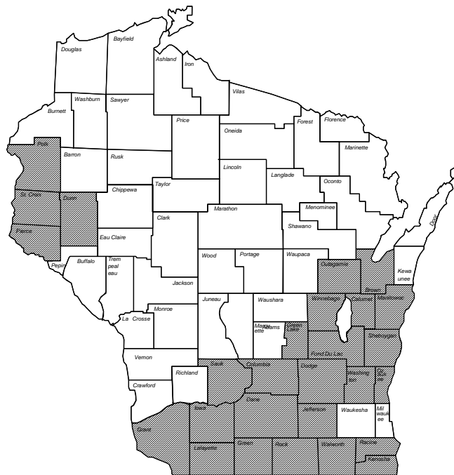
Figure 2. Counties encompassing all or some of Wisconsin's primary pheasant range.