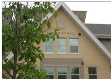
Solar panels on the roof of Dominican Hall reduce energy consumption.