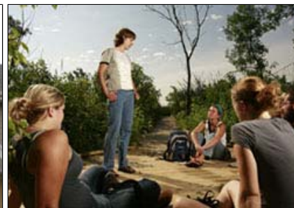
A Natural Sciences class meets on the boardwalk along Lake Wingra.

CONTACT US || SITE MAP || EMPLOYMENT || SEARCH