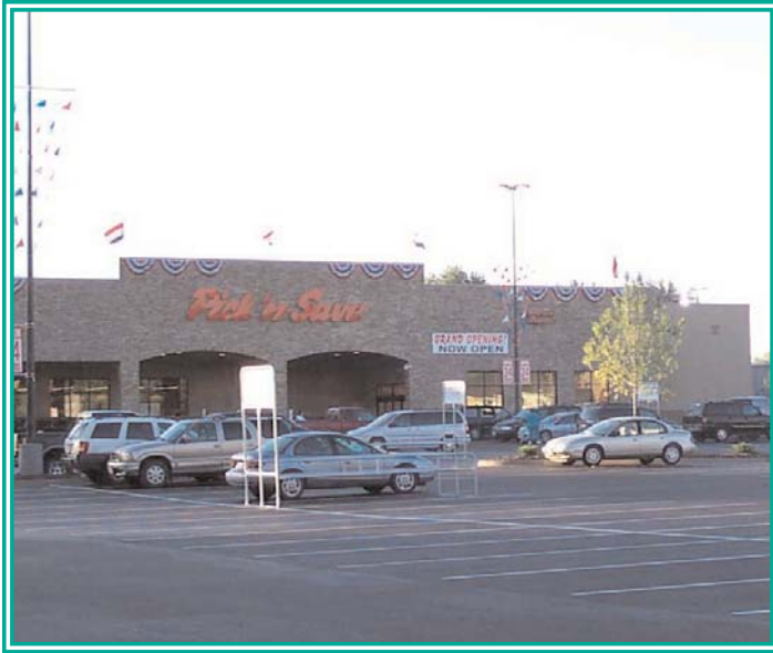
Marshfield's new Pick 'N Save grocery.

The assessed value of the property increased from $115,300 prior to the grant activities to $175,000 after the site investigation and cleanup was completed.