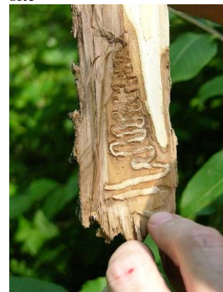
S-shaped Galleries from WI site

Second Location Identified in Wisconsin - Less than a week later on August 7, the Wisconsin Department of Agriculture, Trade and Consumer Protection (DATCP) declared a quarantine for all of Ozaukee, Washington, Fond du Lac, and Sheboygan Counties. The size of the infestation is currently unknown, so FdL and Sheboygan Counties were also included because of their proximity to the known infested area. A map of the EAB detections and quarantined counties is available from: http://www.emeraldashborer.wi.gov/pdf/WIEABQuarantine.pdf