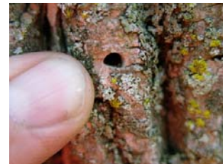
D-shaped exit hole from WI site