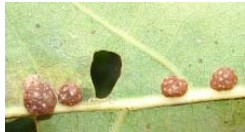
A warty gall on the underside of a leaf caused by a Cincticornia sp. of midge.

Oak galls – quite a number of galls are showing up on oak this year, below is a selection of some of the more unique ones that I've been seeing in the region.