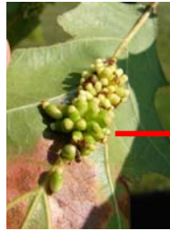
Unknown gall (close-up at right).