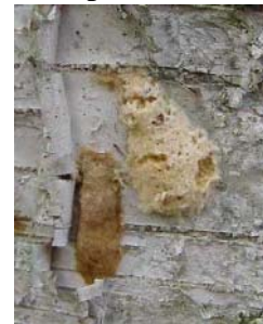
New eggmass on left, old eggmass on right.

Now is the time to start looking for gypsy moth egg masses to predict the pest's population size and potential damage to trees next year. The egg masses are tan-colored, about the size of a nickel or quarter, and feel firm. Older egg masses that are soft and faded are not a concern because the eggs hatched this past spring. Most egg masses will be found on tree trunks and the undersides of branches, but they can also be found on buildings, firewood, vehicles, and other outdoor objects. Homeowners with egg masses on individual yard trees can help to reduce the population by removing egg masses within reach and drowning them in soapy water for two days, or by applying horticultural oil available at many garden centers and other retail outlets. The best time to oil egg masses is anytime after the first hard frost in fall through the first week in April, on a day with at least 40 degree temperatures.