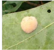
A woolly gall, probably Andricus quercusflocci , a cynipid wasp.