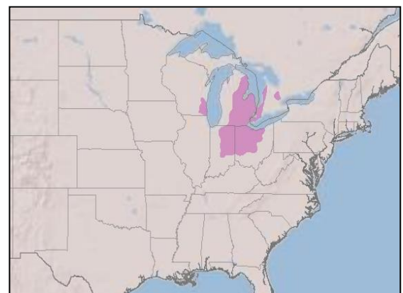
Global range map for the Butler's gartersnake. (NatureServe 2013)