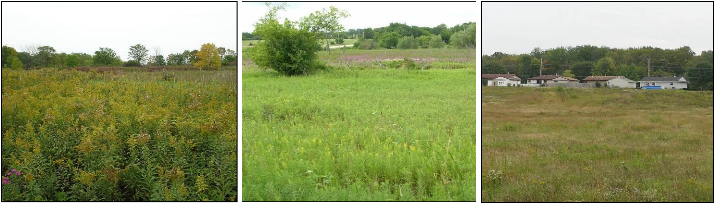
Examples of Butler's gartersnake habitats in Wisconsin.

Threats: Loss and fragmentation of suitable wetland and upland habitat is the primary threat to the Butler's gartersnake and arises from development, agriculture, road construction, and natural succession. Development, agriculture, and roads may also impact this species by altering hydrology.