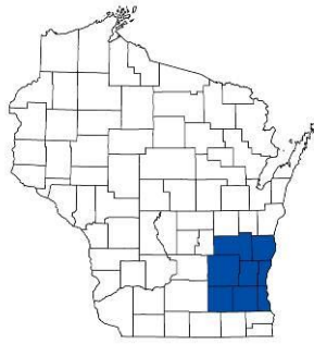
Counties with documented locations of Butler's gartersnakes in Wisconsin.

Wildlife Action Plan Area Importance Score: 4