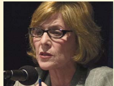
First elected to the U.S. Senate in 1992, Senator Barbara Boxer (D-Calif.) is now chair of the Environment and Public Works Committee.

Finally, I want to thank Al Gore for his work. As a policymaker, I wouldn't be in the position I am today without him. I really think people looked at this issue last November 7 and voted in many areas because of it. I make a commitment to you now that the vice president's work is going to bear fruit.