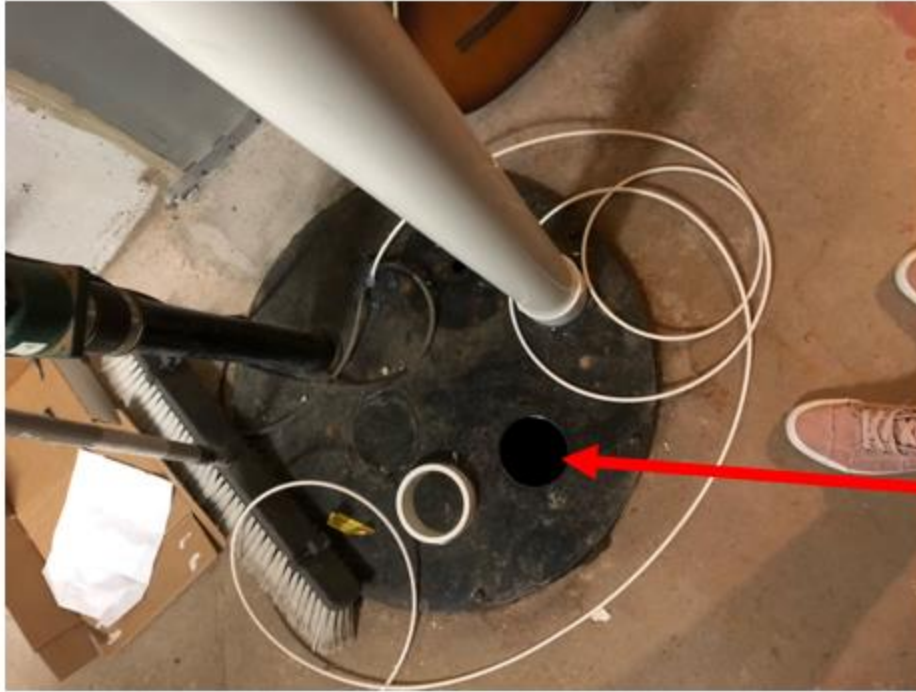
Open hole in the at the base of the northern basement