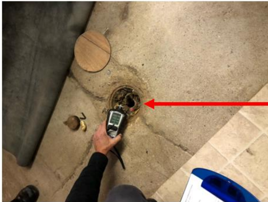
What appears to be an abandoned mo northern basem to be filled, bu the top with co elevations wer PID.