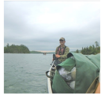
Outward Bound Trip - Boundary Waters