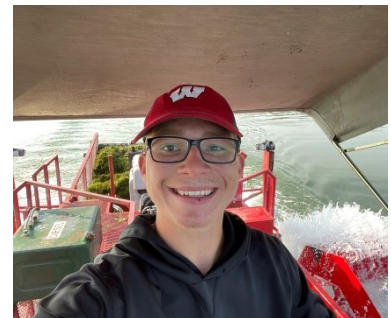
Summer job - lake harvesting aquatic invasive plants