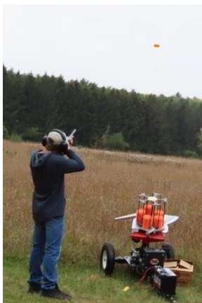
Learning to shoot clay targets