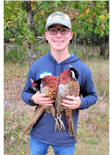
2021 pheasant learn to hunt