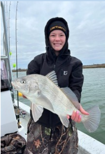
Destiny, YCC delegate from Douglas Co. caught this black drum while in Texas.