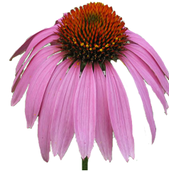
PURPLE CONEFLOWER ( Echinacea purpurea ) Blooms Jun-Oct