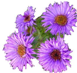
NEW ENGLAND ASTER ( Symphyotrichum novae-angliae ) Blooms Aug-Oct