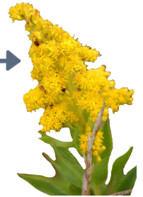
SHOWY GOLDENROD ( Solidago speciosa ) Blooms Aug-Oct