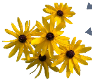
SWEET BLACK-EYED SUSAN ( Rudbeckia subtomentosa ) Blooms Jul-Oct &