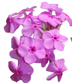
PRAIRIE PHLOX ( Phlox pilosa ) Blooms Apr-Jun

Many of these flowers need a period of freezing in order to germinate. Scatter seeds in your yard just before a snowfall, or cold stratify and germinate them indoors to give them a jump-start in spring! Bloom times provided by Wisconsin State Herbarium, UW-Madison.