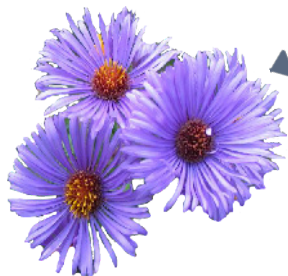
AROMATIC ASTER ( Symphyotrichum oblongifolium ) Blooms Sep-Oct