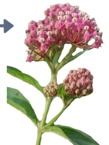
RED (SWAMP) MILKWEED* ( Asclepias incarnata ) Blooms Jul-Aug