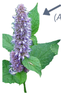
ANISE HYSSOP ( Agastache foeniculum ) Blooms Jul-Sep

Turn your yard into a monarch oasis! These 12 species are some of monarchs' absolute favorites. Three species of milkweed (a plant on which monarchs 100% depend, denoted by *) are included! Learn how you can help monarchs at wimonarchs.org .