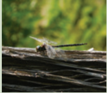
Peninsula State Park

In May, the Friends of Wisconsin State Parks announce the winners of the Incentive Grants, which are awarded to local Friends groups to support naturalist programs. The grants help provide new educational materials at parks and nature centers. May also is a popular time for school field trips, and the Friends help the parks by presenting programs, conducting workshops and leading guided nature walks for school groups.