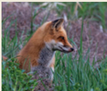
Lakeshore State Park

FWSP hosts several Work*Play*Earth Day events in April and May. Volunteers at these events help the parks by cleaning up picnic and campground areas, planting trees, clearing park trails and removing invasive species such as garlic mustard. The Friends groups typically provide lunches to say thanks to everyone who has volunteered for the day. Trail-building crews also are out getting the park trails ready for summer users. Many volunteers even "adopt a trail" and do regular trail work throughout the year.