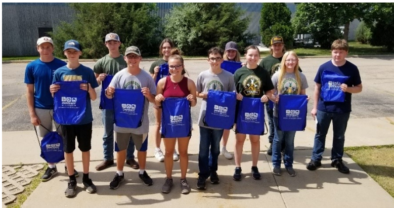
YCC delegates toured the WI DNR Science Operations Center in Madison. The group rotated through 6 interactive stations to learn more about natural resource careers, wildlife disease, citizen science, fisheries, monitoring equipment, communications, and deer management.