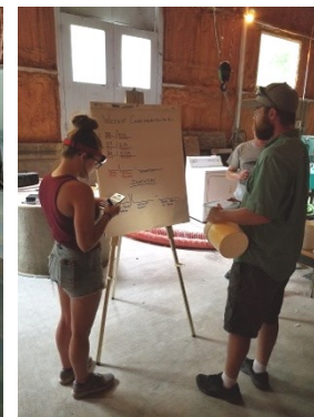
YCC delegates worked together on a math exercise to determine fish weight and inventory.