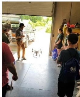
The group watched a drone demonstration and learned about the importance of aerial monitoring for wildlife and mapping applications.