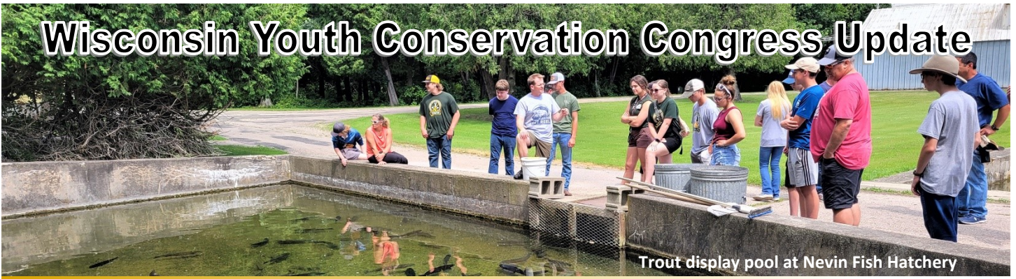
Trout display pool at Nevin Fish Hatchery