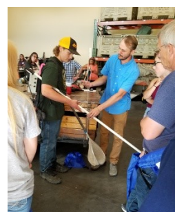
DNR Fisheries staff demonstrated how to use fish shocking equipment.