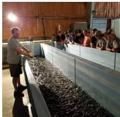
Fish hatchery staff feeding the rainbow trout.