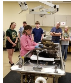
Staff at the Science Operations Center shared information about wildlife disease and x-rays showing internal poisoning from lead.