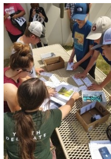
YCC delegates learned about the citizen science project, Snapshot Wisconsin and participated in a relay race to set up a trail camera and identify wildlife photos.