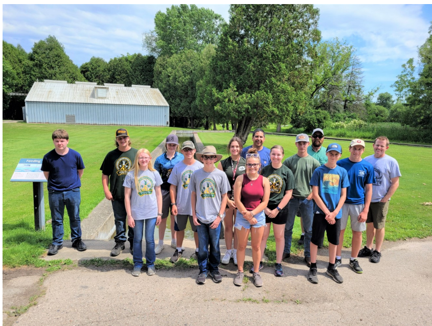
YCC delegates spent the afternoon at the Nevin Fish Hatchery in Fitchburg. The fish hatchery raises trout, and the group got a chance to see the operations first-hand. The fish hatchery is one of the oldest DNR properties in the state.