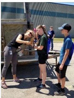
A Wildlife biologist discussed deer monitoring programs and let each YCC delegate try out punching ear tags into cardboard.